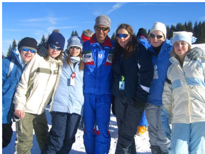
Pupils on the school ski trip

Our children constantly achieve exceptional results in their new schools.