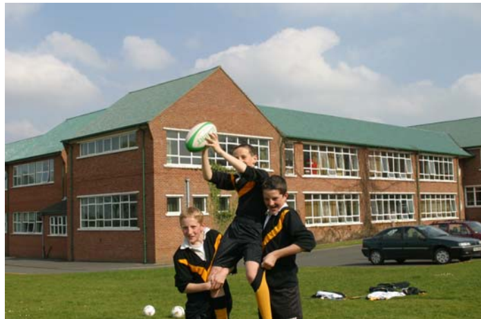
Pupils on the rugby pitch

To encourage participation in a wide variety of extra curricular activities.