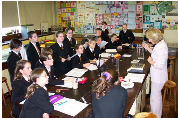
A Science class at Killicomaine