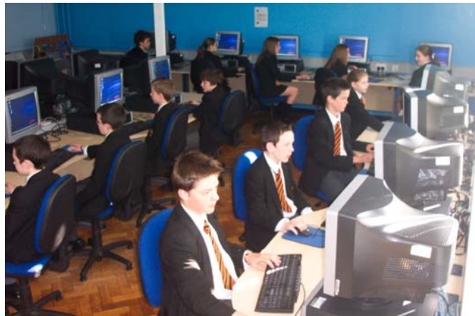
At work in the I.T. room