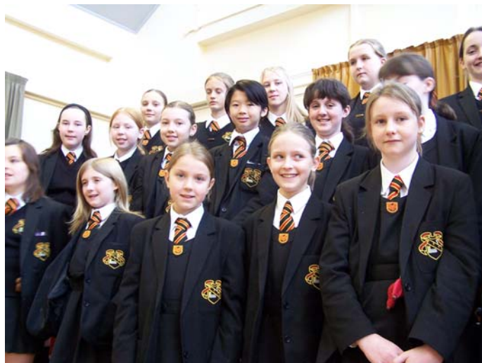
The School Choir recording the 2006 Christmas CD

The Orchestra, like the choir, plays at school functions and entertains within the community.